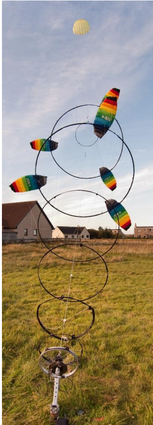
Current model under test

Rod Read from Windswept & Interesting Ltd is going to charge an electric car using a kite turbine.